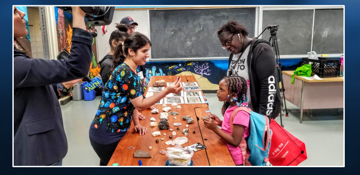
Learning how rocks and minerals contain clues about signs of life on Earth and other planets.