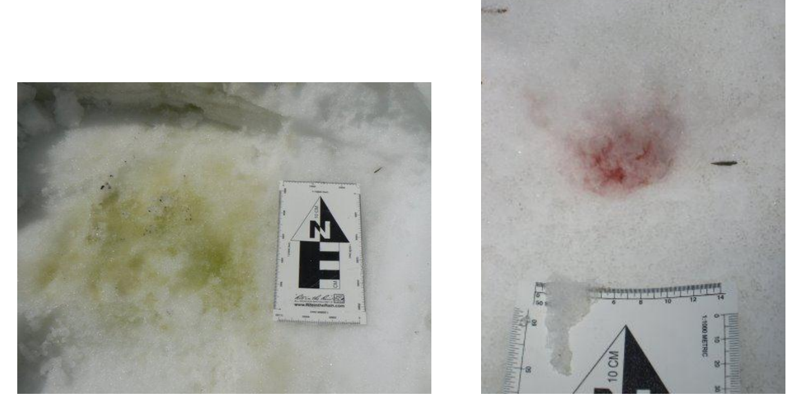
Fig. 3. Germinated snow algae population (green coloration) and sporulated snow algae population (red coloration)