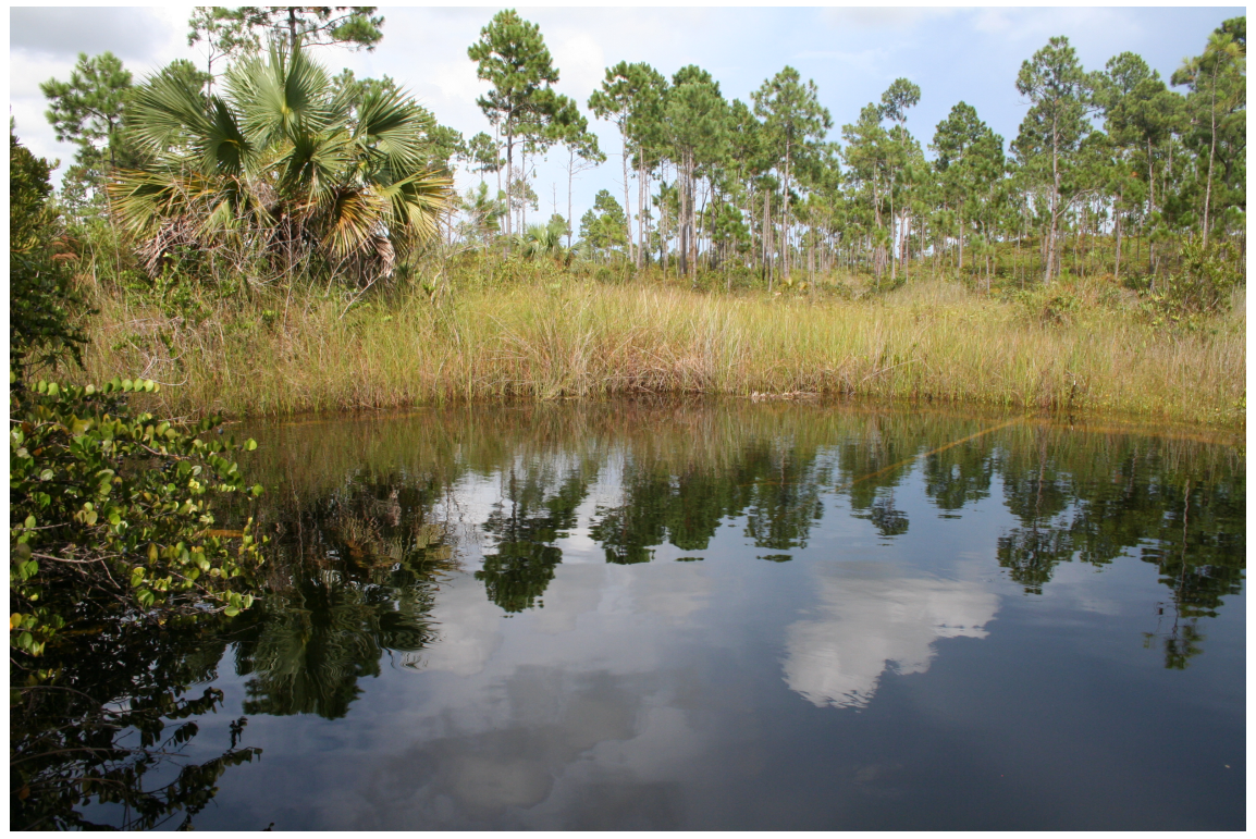
Magical Blue Hole

Magical Blue Hole (MBH) is a sink hole located near Marsh Harbour, Bahamas (26°22'31"N 77°6'14"W) that is more than 200 feet deep and hosts a plethora of microbial biofilms. MBH is stratified with oxic, freshwater on the surface and anoxic marine waters at depth. On the sides of the immersed cave walls, thick biofilms with interesting structural characteristics have been observed.