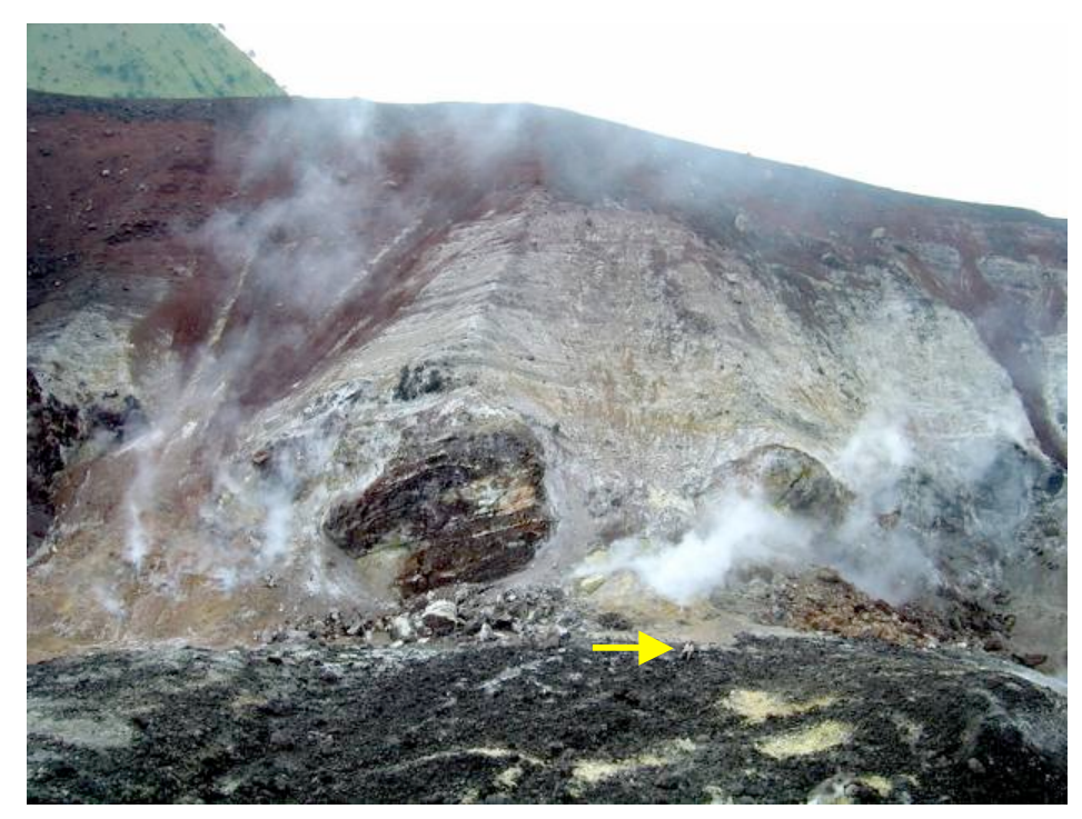
Figure 2. Context photo showing several large-scale fumaroles at Cerro Negro, Nicaragua. Differences in color relate to differing mineral assemblages and degrees of alteration. The arrow points to a person for scale.

We are striving to establish the phylogenetic diversity of the microbial population at the Cerro Negro solfatara system. In addition to the rocks collected for mineralogical analysis discussed above, roughly ten sediment samples were collected within or in close proximity to active vents (Figure 2). We took care to sample the diversity present by sampling half a dozen different vent systems with significant variations in mineralogy (Figure 2). Ongoing culture-independent techniques are expanding our understanding of the geochemical parameters that constrain life in solfatara systems. This work, coupled with theoretical geochemical modeling of such environments, is aiding in the prediction of the biological potential for life in similar systems on early Mars. To date, we have extracted 16S rDNA and are in the process of assessing the environmental population. Understanding the microbial population and their energy sources will yield clues to the habitability of early Mars.