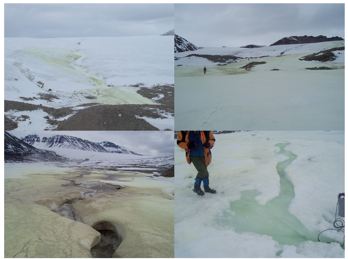
Figure 3 - Top left: view from initial helicopter flyover, top right: walking through sulfur deposits up onto the glacier. Bottom left: yellow sulfur deposits alongside a channel, bottom right: spring source.

Our four person team visited the Borup Fiord Pass site during 16 days in June and July of 2006. This field expedition revealed extensive sulfur deposits in association with multiple channels originating with one main source on the southern portion of the glacier (Figure 3). Yellow to brownish deposits covered an area of many thousand square meters on the southern slope of the glacier and the outwash plain at its toe. Older more brownish deposits at greater distance from the yellow deposits surrounding observed channels were revealed as snow melted. This suggested that the springs had been operational over the course of the winter and had probably changed position during that period. The springs themselves were operating at hugely inflated rates (~2 gallons/second) in comparison to previous years, likely connected with the large quantities of meltwater being generated all over the glacier as snow cover retreated.