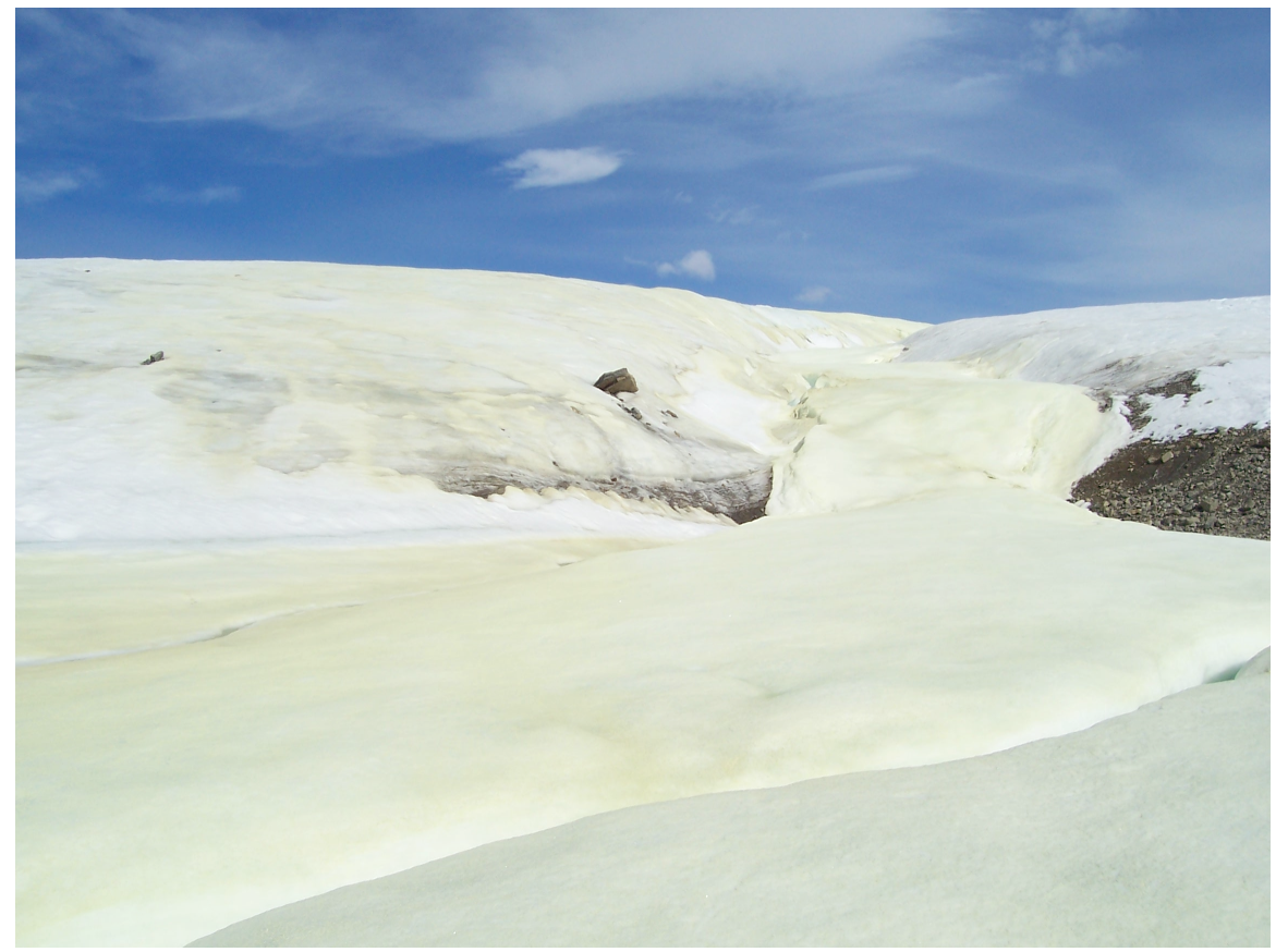
Figure 1 - Sulfur-covered glacial ice observed at Borup Fiord Pass, Ellesmere Island, in the Canadian High Arctic during the course of the 2006 field season.