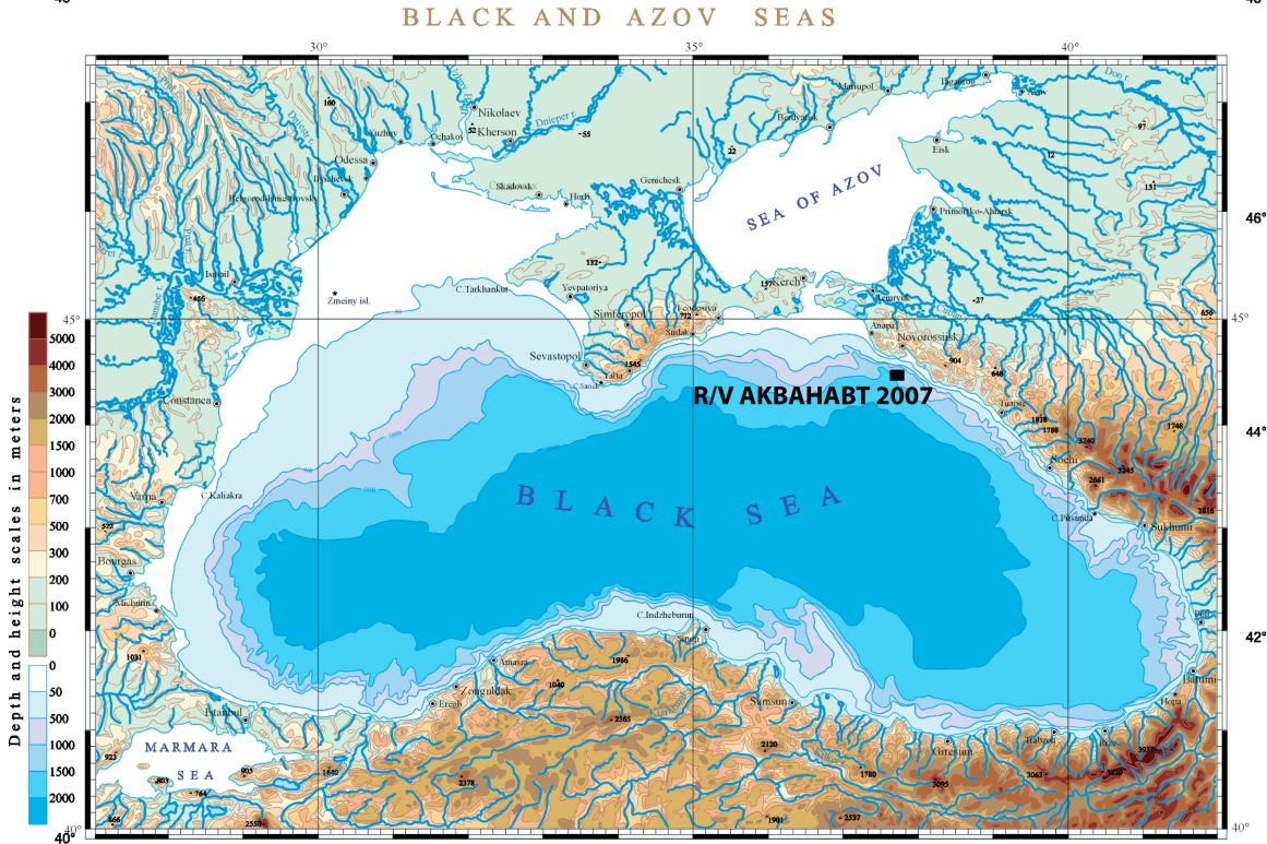
Figure 1. A map of the Black Sea, indicating the sampling station visiting in May 2007 (black square). The map was made by the Remote Sensing Department, Marine Hydrophysical Institute, Ukraine. The shade of blue indicates the depth of the bottom of the Black Sea.