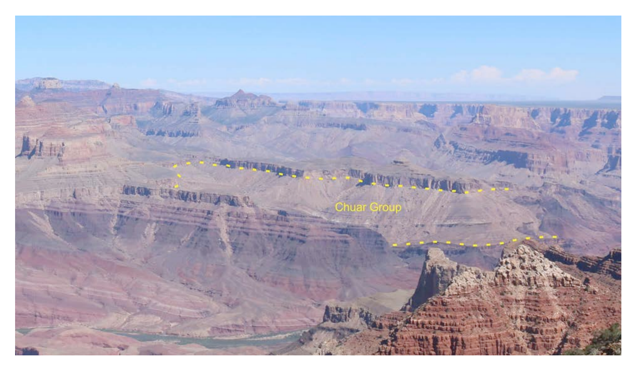
Fig. 1. A panorama of the measured outcrop of the Chuar Group bracketed in yellow dash lines in eastern Grand Canyon, Arizona.

In order to have enough time to finish the planned field work and to avoid the cold season in Arizona, we set off for the field work a couple of days earlier than we had planned in the application form. There were two major tasks for this field work, one was to measure the outcrop of the Chuar Group to set up a detailed stratigraphic column; the another one was to collect many carbonaceous compression megafossils and mudstone/shale samples for acritarch analysis in order to understand the paleobiology of the Chuar Group.