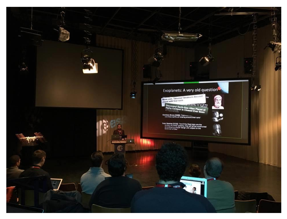
Presenting at ESA-ESTEC, Noordwijk, NL