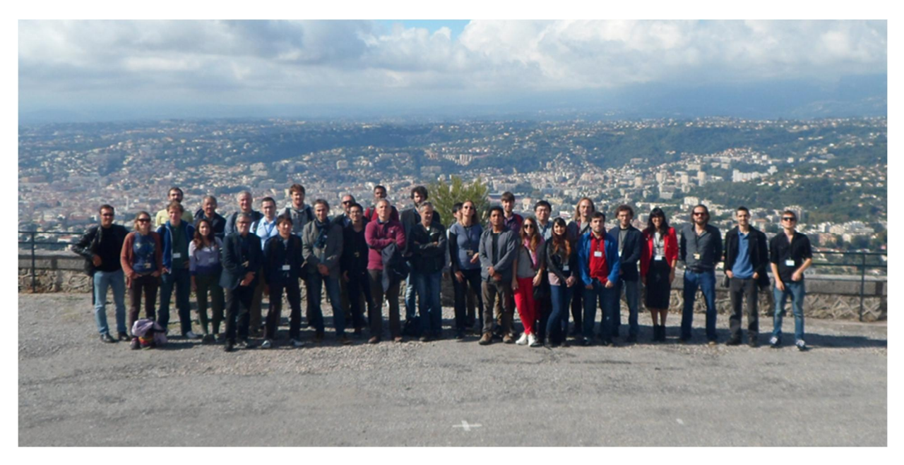
Group Picture Nice meeting

Attendance, in person total: ~8-10 (varied by day) Attendance, Adobe Connect total: ~2-3 (varied by day) Potential products -white paper (collect references, split subsections...) -review paper (incl. Nomenclature!) -requirements for future missions leading to study (phase space not covered by upcoming mission) -follow up workshop/conference/splinter-meeting (lessons learned from this one?)