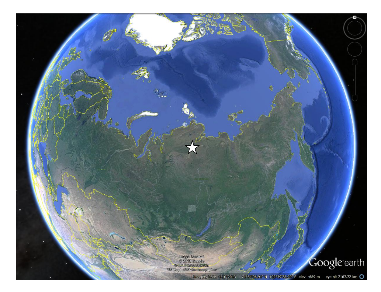
Figure 1. White star marks the approximate location of field work in the summer of 2008, along the Kotuy River in Siberia (71°54 N, 102° 7' E).

The Siberian Traps are difficult to reach, and logistics were complex. As shown in Figure