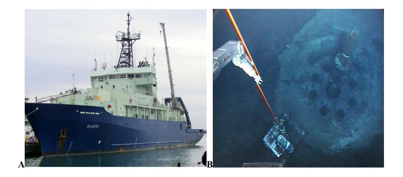
Figure 2. A) R/V Atlantis B) We used recently developed seafloor sampling systems to collect large volumes of high integrity basaltic fluids from Circulation Obviation Retrofit Kit (CORK) observatories inserted into crustal boreholes 1025C (47°88.7'N, 128°64.8'W) and U1301 (47°45.2'N, 127°45.8'W) see figure 1B.

During the past cruise to the Juan de Fuca Ridge flank (June, 2011) on board R/V Atlantis (Fig. 2), the correlation between active microbial metabolic processes in fluids from ocean crust and the physical parameters that characterize these habitats was explored.