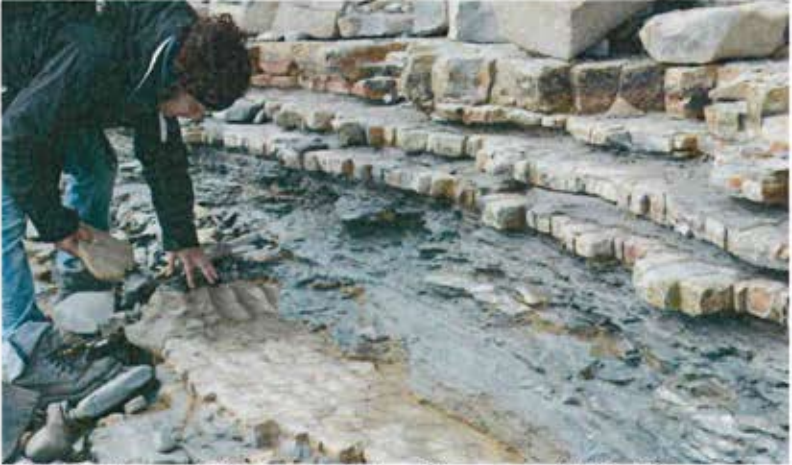
Triassic-Jurassic Boundary beds of Lavernock Point South Wales.