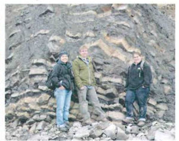
At the Triassic-Jurassic Boundary of Charton Bay, Lyme Regis, Dorset Coast.

Project Title, Paleoenvironmental Significance of Microbialites From the Upper Triassie, Southwestern United Kingdom, and Relevance to the End Triassie Mass Ketinction