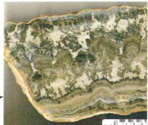
Polished piece of the 'Cotham Marble' microbialites.