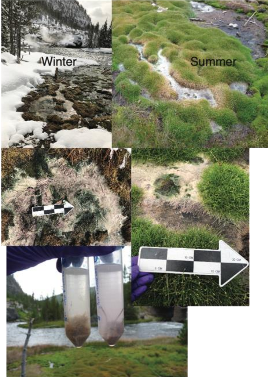
Figure B Yellowstone National Park Field Site