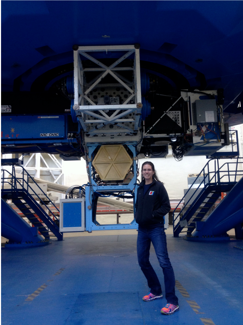
Me with DSSI mounted on the Gemini Telescope (DSSI is inside that white cage)

Below I include some pictures from the second two trips; unfortunately I didn't get any pictures at Lowell!