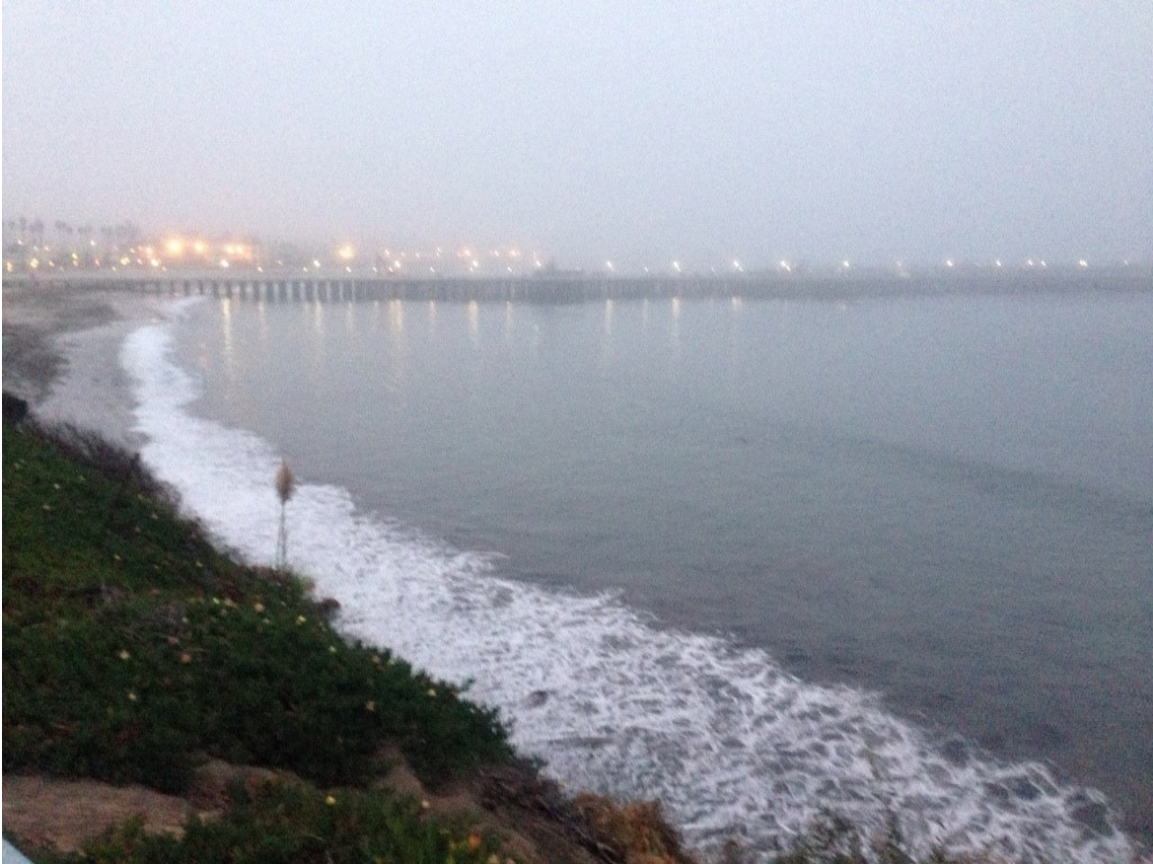
Look at the wharf from across the beach in Santa Cruz